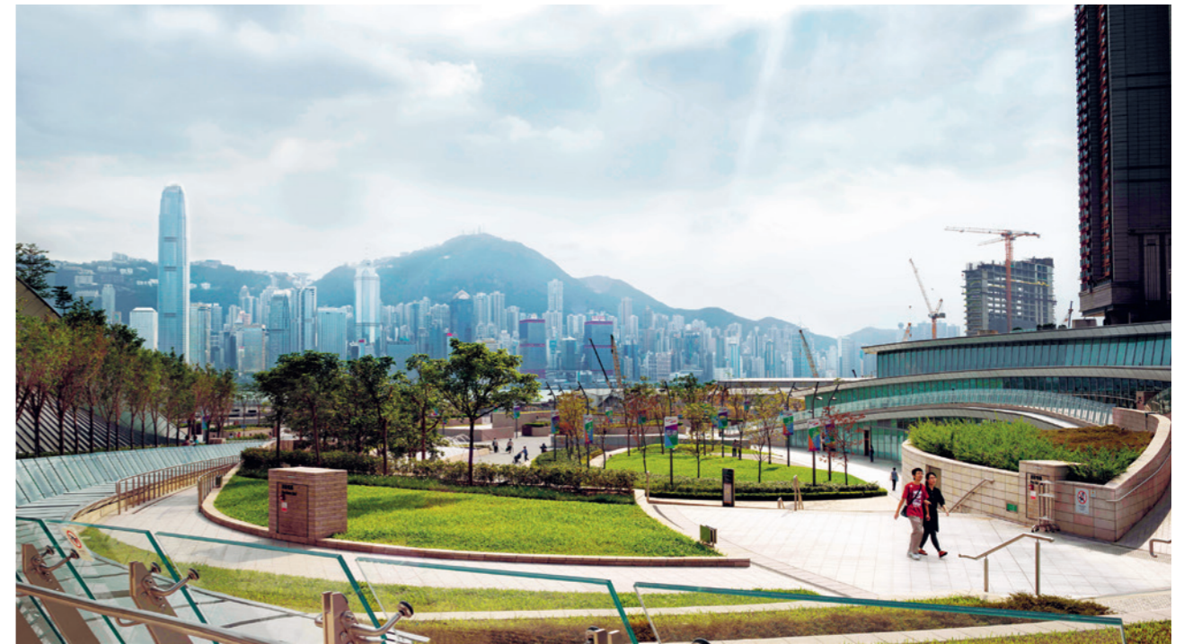
The sweep of the station embraces views south to the Central skyline and The Peak

Aedas' winning bid for the project had much to do with making the terminal – XRL's first and only station within Hong Kong – a statement piece: nothing less than a gateway to the city. With most of the building underground, reaching to a depth of 25 metres, its sheer scale – 400,000sqm (4.3 million sqf) of usable floor space – puts it on par with the world's biggest and busiest airports. Its monumental proportions are intentional, a major hub in response to the increasing rail traffic in China. Andrew Bromberg, global design principal at Aedas, designed an arcing volume that reaches 25 metres into the sky while sweeping around to embrace views south towards the Central skyline. With a carpeting of stepped greenery covering the structure's roof laid out like a welcome mat for public enjoyment, the station aims to attract both travellers and locals alike. "The forms were a direct result of harnessing and redirecting all of the surrounding contextual connections toward and through the station toward Victoria Harbour and The Peak," says Bromberg. "The merging of these flows is seen as analogous to how train lines would merge into a terminus station."