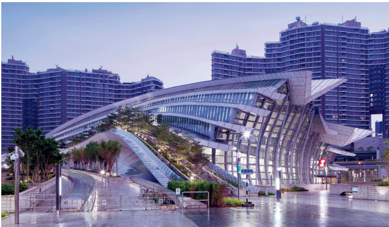
The ground-hugging building is in contrast to the surrounding high-rise, the defining typology of Hong Kong