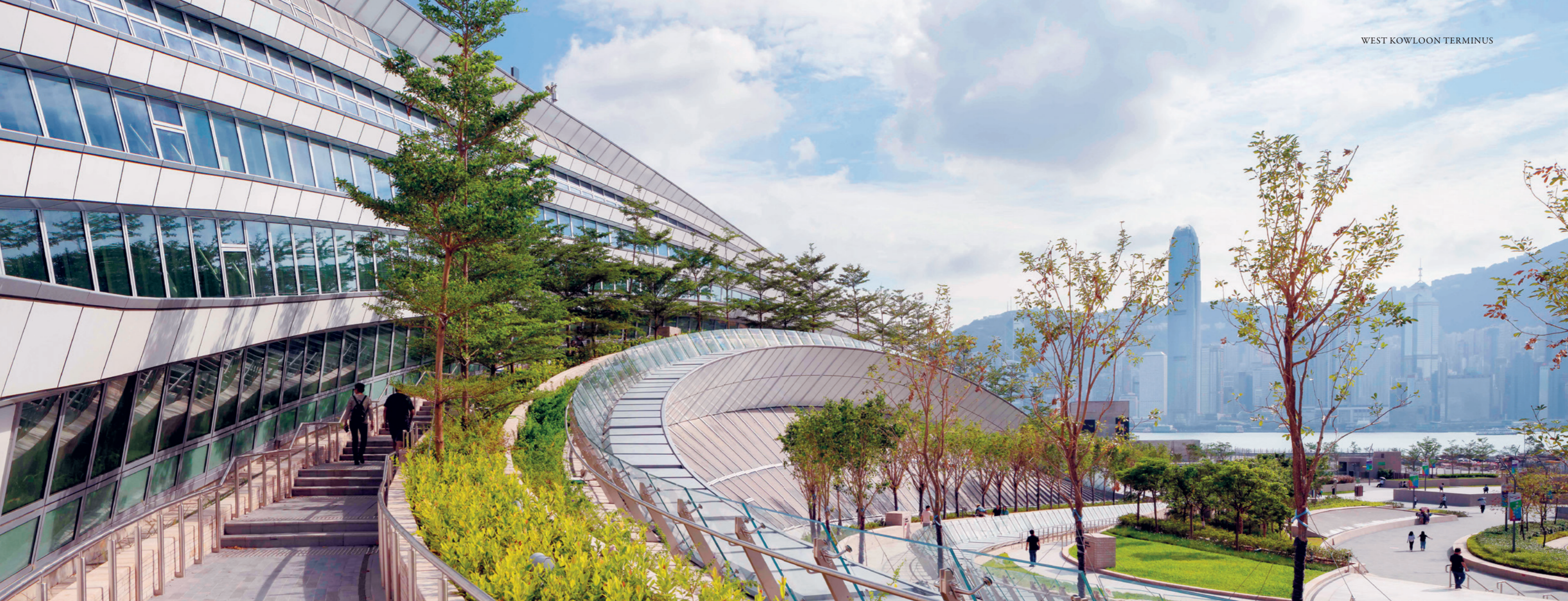
The Hong Kong West Kowloon Station has given the city three hectares of landscaped open space