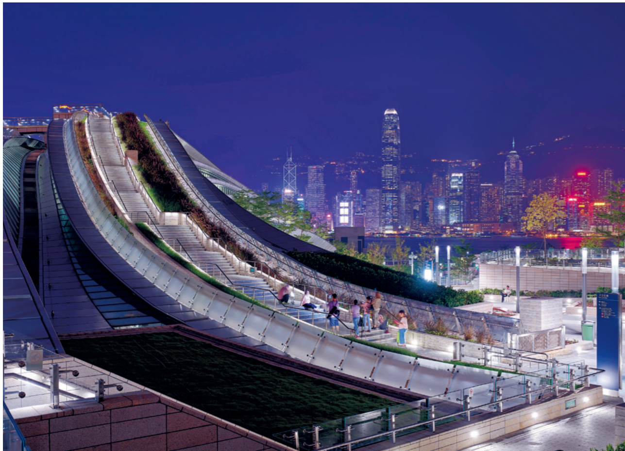
Bromberg wanted a building on which people could walk, and created the roofscape as a park with stepped greenery