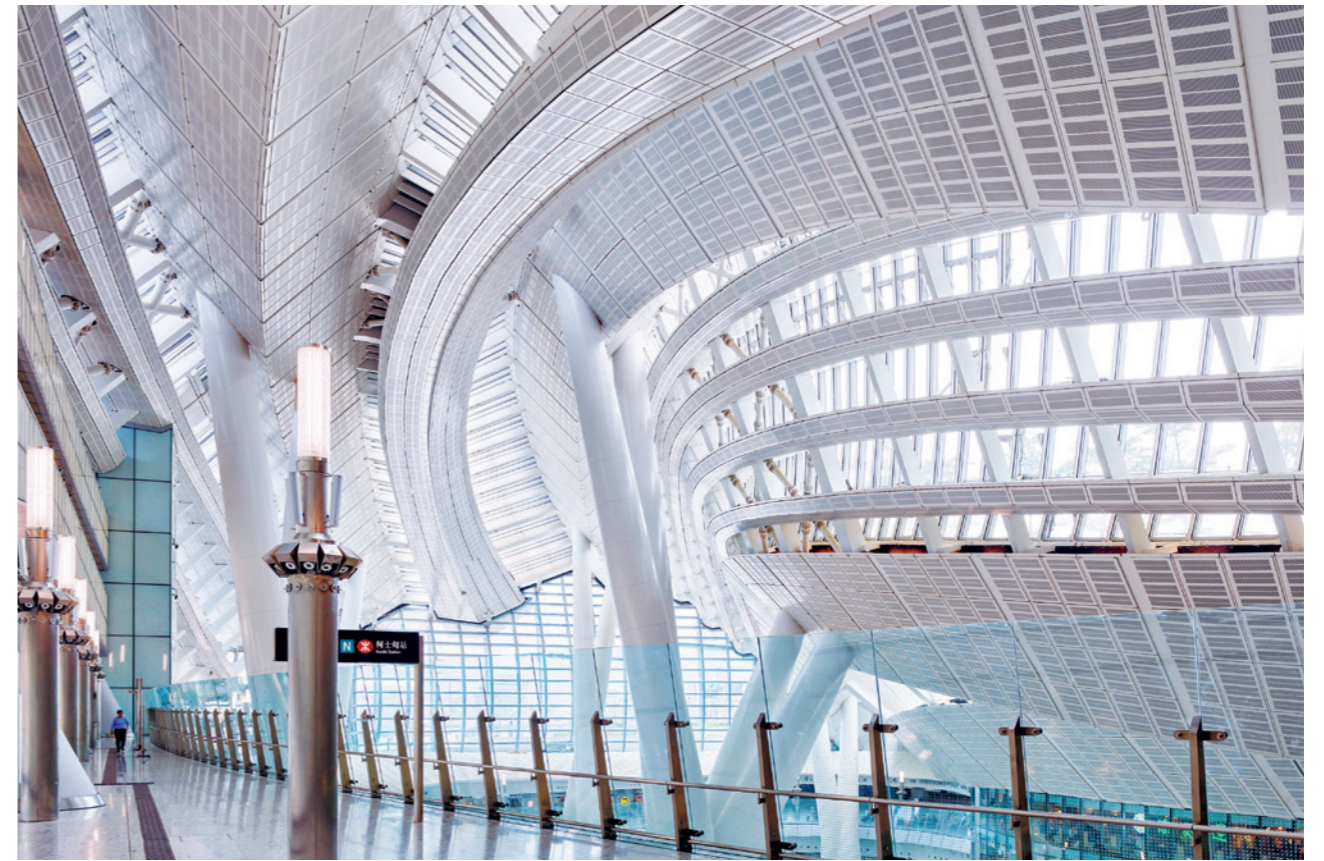
Skylights and clerestories provide natural light and reduce the need for artificial lights, while cool air flows downwards

The structure's central void further helped resolve the controversial arrangement of having both Hong Kong and mainland Chinese customs officials within the same premises. "By stacking the immigration halls, we were able to make them extremely efficient," says Bromberg. "This efficiency afforded the design an opportunity to have a big void down to the departure hall. That big void was essential to the success of the project – it allows natural wayfinding and easy orientation for all visitors. You always know where you are in the station relative to the void. Most importantly, you always know you are in Hong Kong, with the views out of the station towards Central District and The Peak visible to the south."